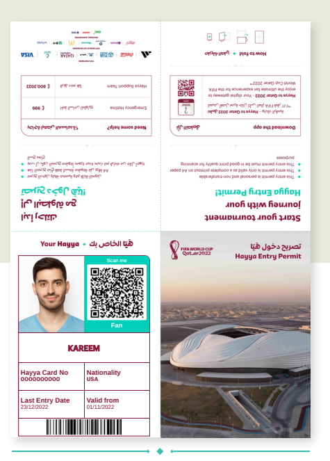
Hayya Entry Permit (sample)